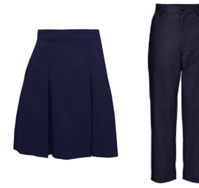
Navy Blue Skirts or Pants 5th, 6th, 7th, & 8th grade