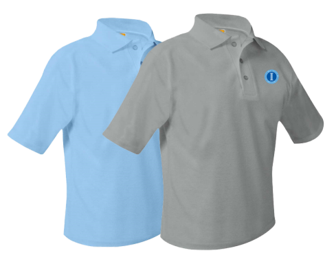
Grey or Blue Intrepid Polo 7th & 8th grade only