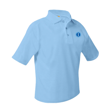
Light Blue Intrepid Polo 5th & 6th Grade