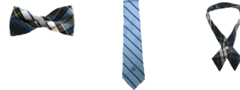
Corbatin, corbata Independence Academy