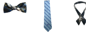
Independence Academy Uniform bow-tie, tie, or cross-tie