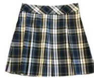
Falda de uniforme de Independence Academy