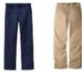
Pantalón de azul marino o caqui