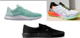
Cualquier zapato de tenis de cualquier color, con suelas no-negro y sin logotipos