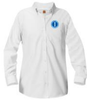
Camisa blanca de botones con logo de Independence Academy