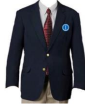
Blazer de azul marino con el logotipo de Independence Academy