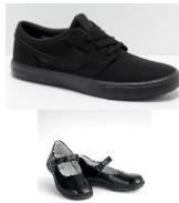
Zapatos de vestir Café Oscuro o Negros (solid color, no visible logo)