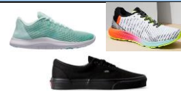
Any color or pattern athletic shoes with non-black soles and no visible logos