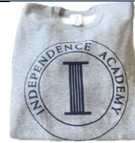
Scholars pueden usar suéteres sólidos, azul marino, sudaderas, chalecos o blazers. Scholars también pueden usar la camiseta gris de Independence Academy, con el logotipo