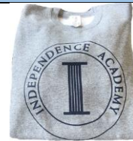
Scholars may wear solid navy blue or gray sweaters, sweatshirts, or vests. Scholars may also wear the Independence Academy crewneck sweatshirt with the logo, as shown above.