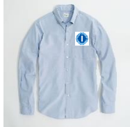
Camisa azul de botones con logo