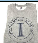
Prepsters may wear solid navy blue or gray sweaters, sweatshirts, vests, or blazers. Prepsters may also wear the Opportunity Academy crewneck sweatshirt with the logo, as shown above.