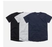
Camisetas debajo del uniforme deben ser de color negro, blanco o azul marino