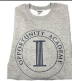
Prepsters pueden usar suéteres sólidos, azul marino, sudaderas, chalecos o blazers. Prepsters también pueden usar la camiseta gris de la Academia de la Oportunidad, con el logotipo