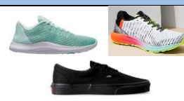
Any color or pattern athletic shoes with non-black soles and no visible logos